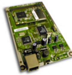
EZ Bridge 802.11G PCB Kit Item Number: 11-130