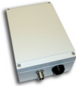
NEMA-4 EZ Bridge 802.11G Weather Proof Case Item Number: 11-212